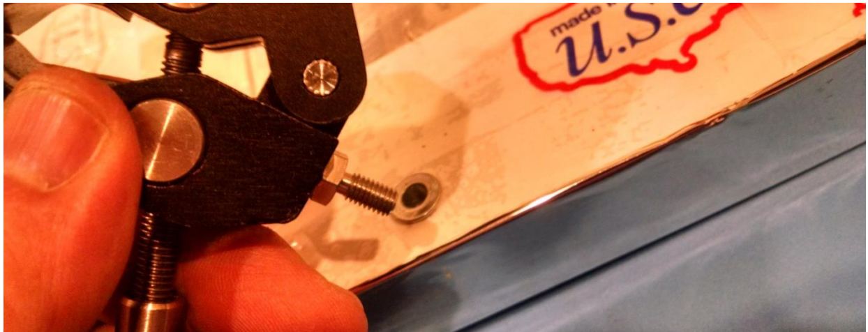
6) AFTER THREAD HAS REACHED BOTTOM, BACK-UP CLAMP UNTIL IS PARALLEL WITH MIRROR SIDE.