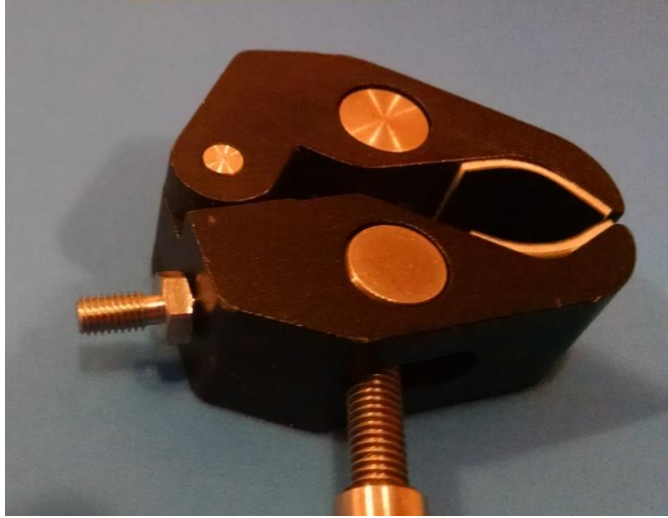
5) SCREW CLAMP AND STUD ASSEMBLY INTO BACK OF MIRROR PANEL